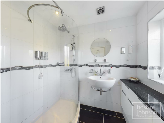
Large walk in shower, wc with concealed cistern, wash hand basin with storage, tiled walls and floor, chrome heated towel rail, ceiling spotlights, double glazed window to rear.