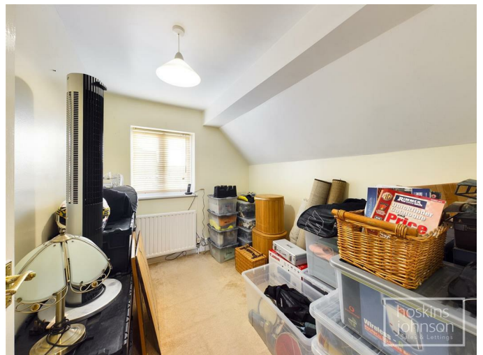
Double glazed window to front, radiator.