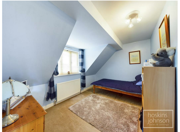
Double glazed window to front, radiator.