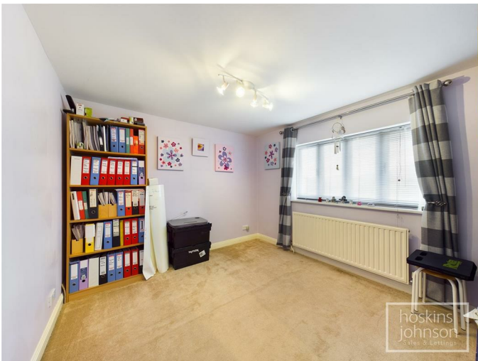
Double glazed window to rear, radiator.