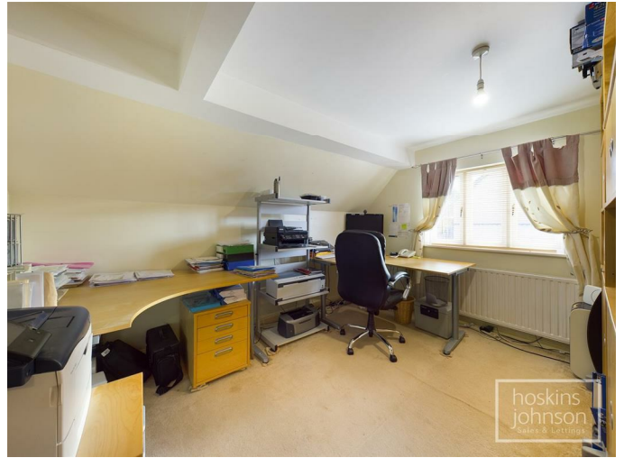
Double glazed window to front, radiator.