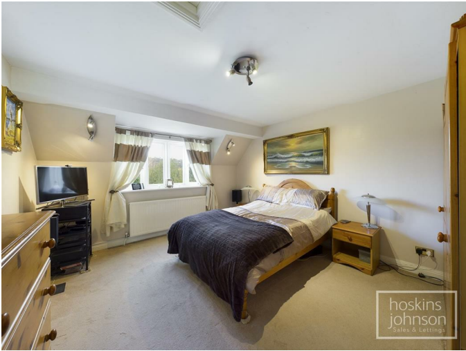
Double glazed window to rear, radiator, attic access.